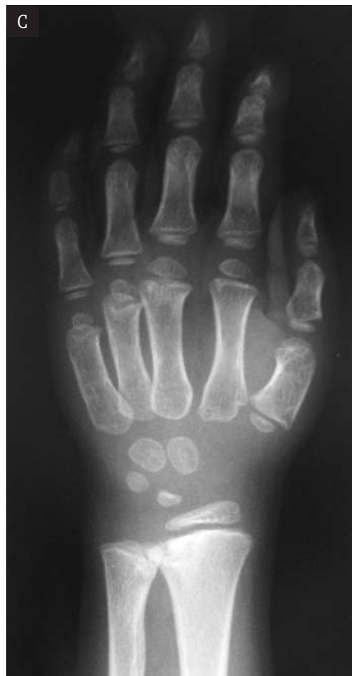
Figure 1 A-C. CASE I. A 5 ½-year-old boy. A. Photograph of the patient. Height 112cm (-2SD). The trunk and the extremities are shortened. Note the broad thorax. B. Thoracic kyphosis. Platyspondyly with anterior wedging of the thoracic vertebrae. C. Bone age corresponds to the chronological age of about 3 ½ years. Note narrow radial growth cartilage.

Rycina 1 A-C. Przypadek I. Chłopiec w wieku 5 ½ lat. A. Zdjęcie chłopca. Wzrost 112cm (-3SD). Skrócenie tułowia i kończyn. Szeroka klatka piersiowa. B. Tylne skrzywienie kręgosłupa piersiowego. Spłaszczenie kręgów piersiowych zwłaszcza w części przedniej. C. Wiek kostny odpowiada wiekowi chronologicznemu 3 ½ lat.