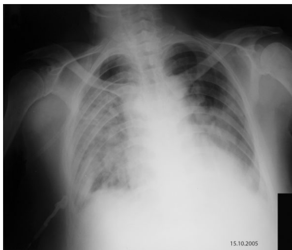
Figure 1. Third day of hospitalization (ATRAS beginning). Extensive parenchymal infiltrates in both lungs. Pulmonary apices spared. Trace of fluid in the pleural cavities. Enlarged left ventricle. Radiological findings resemble ARDS.

Laboratory tests still shared increased leukocytosis (WBC–32.5 g/l), anemia (Hb–9.59 g/dl), thrombocytopenia (PLT–35 g/l), decreased fibrinogen level and hyperglycemia. Bacteriological investigations (swabs from body cavities, blood and urine cultures) were negative.