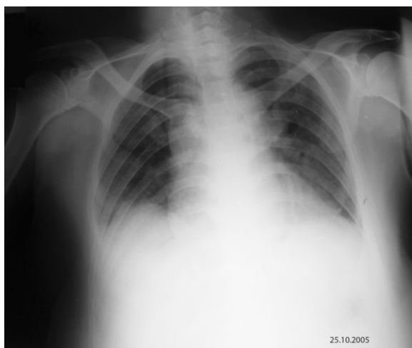
Figure 4. Thirteenth day of hospitalization. Further regression – the lungs free from pathological changes, trace of fluid within the right pleural cavity.

Temperature reduction to the level below 37°C was obtained, with a slight improvement of the patient's general condition. X-ray performed on day 5 of hospitalization still revealed extensive density areas and increased amount of fluid in both pleural cavities (fig. 2). On the next days, the patient's condition improved gradually – the dyspnea and edema were reduced, and no new extravasations appeared. Crepitant rales over the lung fields were still present on auscultation. Laboratory tests revealed reduction of leukocytosis (WBC–13 g/l). On day 7, another chest X-ray (fig. 3), revealed partial regression of interstitial abnormalities, total regression of exudate in the right pleural cavity and a small amount of fluid in the right pleural cavity, as well as normalization of heart size.