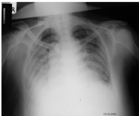
Figure 3. Seventh day of hospitalization. Partial regression of parenchymal infiltrates. Complete regression of pleural effusion within the left pleuro-costal recess and trace of fluid within the right one. Heart shape – normal.

On the subsequent days of hospitalization, the respiratory symptoms subsided gradually. However, the signs of hemorrhagic diathesis (extravasations) increased, and laboratory investigations revealed increased leukocytosis (on day 12, WBC 47.95g/l), aggravation of anemia and worsening of the coagulation system parameters. At that time (day 13), further regression of pulmonary abnormalities was observed on chest X-ray – no densities in the lung fields and traces of fluid in the left pleural cavity (fig. 4).