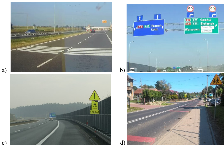
Fig. 1. Analysed non-standard road marking and signs: a) transverse strips on approach to toll plaza; b) speed limit signs dedicated to selected lanes (located above the lanes); c) non-standard sign of hazardous curve; d) red transverse strips on approach to crosswalk.

In analysis of effectiveness of transverse strips located on approaches to toll plazas, toll plaza "Zernica" on A4 motorway was chosen as a control group. The traffic organization is the same at all 3 toll plazas (the same perception of toll plaza by road users, a similar number of lanes and toll booths for electronic toll collection with additional marking and signs).