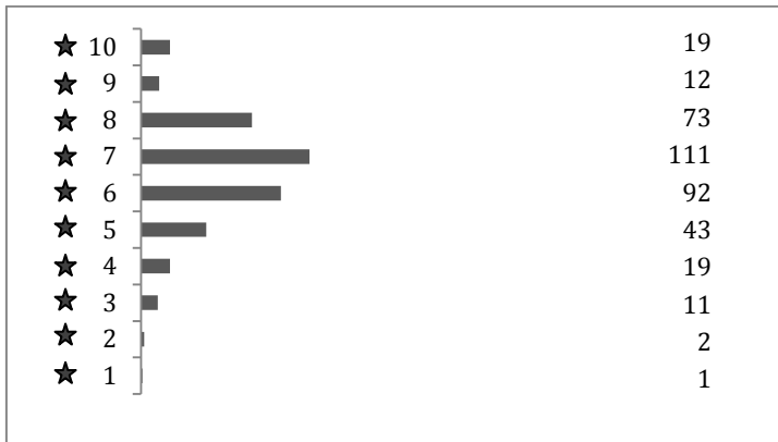
Ratings of Tove Jansson: Mama Muminków given by the members of the website lubimyczytac.pl 37

always rely on the honest reviews of the peer readers in passion. The reviews published on Internet blogs on new book releases and lubimyczytac.pl website present a more diversified, yet objectively trustworthy point of view. The book received average 6.63 out of 10 marking with 383 ratings and 67 reviews to be read, there are also more than 1500 not registered opinions. 36