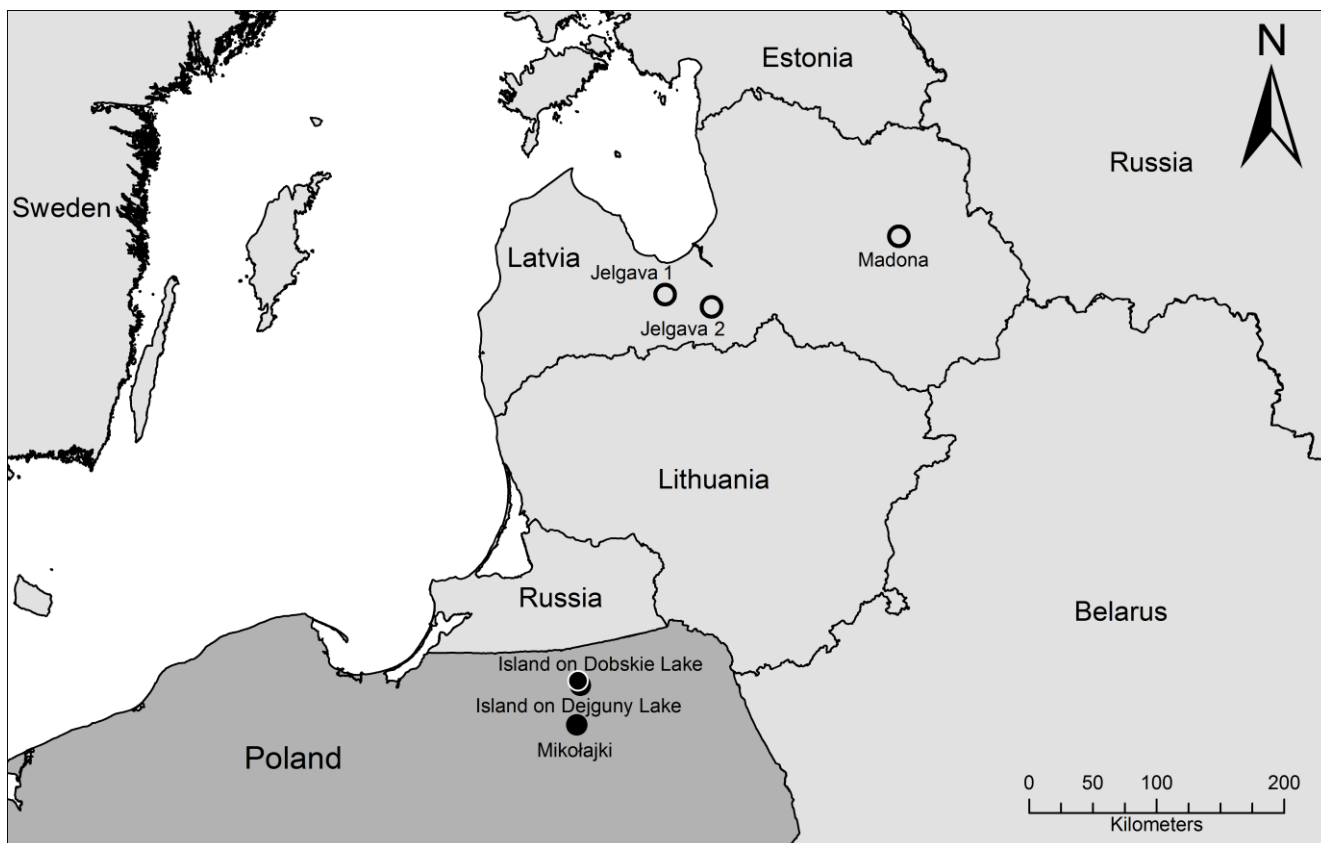
Figure 1. Map of the north-eastern part of Poland and the surrounding countries showing the three trapping sites of bank voles in Poland described here and the three localities in Latvia where related PUUV sequences were detected [42].

Subsequent screening of lung tissue by PUUV/TULV S segment RT-PCR test revealed three positive samples from male bank voles (with two being seropositive and one being seronegative) from the forest near Mikołajki (Table 1). Cloning of the amplification products and sequencing confirmed identical sequences of 711 nucleotides length for all three samples (accession number KF906512). A BLASTn search identified the sequence as a PUUV sequence with the highest similarity to a PUUV sequence derived from a bank vole originated from Jelgava, Latvia (Mg149/2008; JN657228; Jelgava 1, Figure 1). A phylogenetic analysis of this novel S segment sequence confirmed its closest similarity to this sequence from Jelgava 1 and showed clear a distinctness from other PUUV sequences in the Baltic region, Russia or Germany (Figure 2). The nucleotide sequence divergence of the novel sequence from Poland to the sequence from Jelgava 1 was 11.2%, whereas the sequence divergence to other two sequences from Latvia ranged from 17.5% to 19.2% (Table 2). The amino acid sequences of the novel strain and that from Jelgava 1 were identical, but the corresponding amino acid sequences from the other sites in Latvia varied by 4.6% to 5.2%. The nucleotide sequence divergence of the Mikołajki sequence to representative sequences covering the distributional range of PUUV in Europe reached 14.0% to 21.3%.