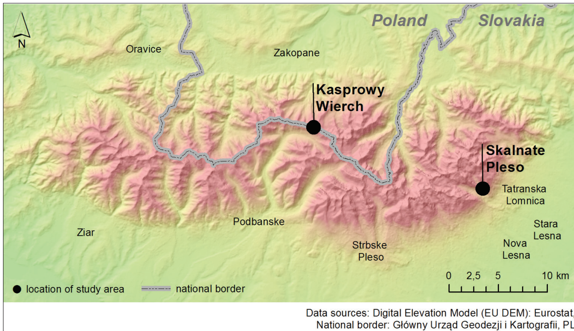
Figure 1 – Location of study areas in the Tatra Mountains.

& Kajala 2012). There is a wide range of typologies based on motivational factors in outdoor recreation studies (Bieger & Laesser 2002; Sterl et al. 2006; Park & Yoon 2009; Needham et al. 2010; Konu & Kajala 2012; Rid et al. 2014). Also very popular are typologies based on benefits sought, visitor attitudes or cultural values (Kastenholz et al. 1999; Galloway 2002; Frochot 2005; Li et al. 2006; Molera & Albaladejo 2007). Some authors segment by using combined variables, including motivational or sociodemographic factors, or other psychographic factors (Fariás Torbidoni et al. 2005; Taczanowska et al. 2006; Smith et al. 2014). Typologies based on crowding perception (Arnberger & Haider 2005) or type of activity (Burns & Graefe 2002) are also common in tourism literature. Modern solutions such as fuzzy segmentation are also found (D'Urso et al. 2016). In theoretical studies, authors focus mainly on motivational factors or visitor attitudes (Przeclawski 1996; Ankre 2005; Stankey 1973), while other well-known theoretical typologies are based on the degree of institutionalization of the tourist, e.g. drifter, explorer, individual mass and organized mass tourist types (Cohen 1979).