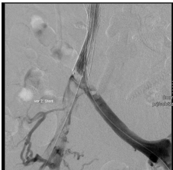
Figure 4. Reduced blood flow in iliac veins.