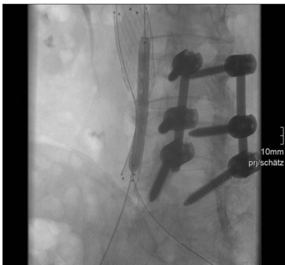
Figure 3. Balloon stent dilatation.

A control phlebography (Figure 4) showed improved perfusion of the IVC, as well as reduced flow in both CIVs. After a crossover implantation [6] of two stents (right 12/42/120, left 14/40/120) into both common iliac veins, no residual stenosis was visible and fast backflow of the contrast medium to the right atrium was demonstrated (Figure 5). Anticoagulation therapy was commenced following the intervention.