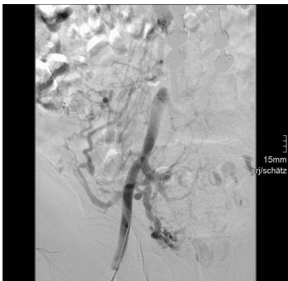
Figure 1. IVC occlusion.