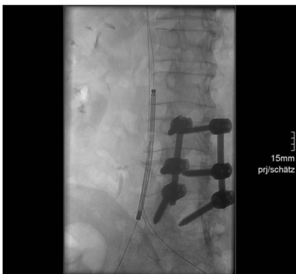
Figure 2. Placement of a stent in IVC.