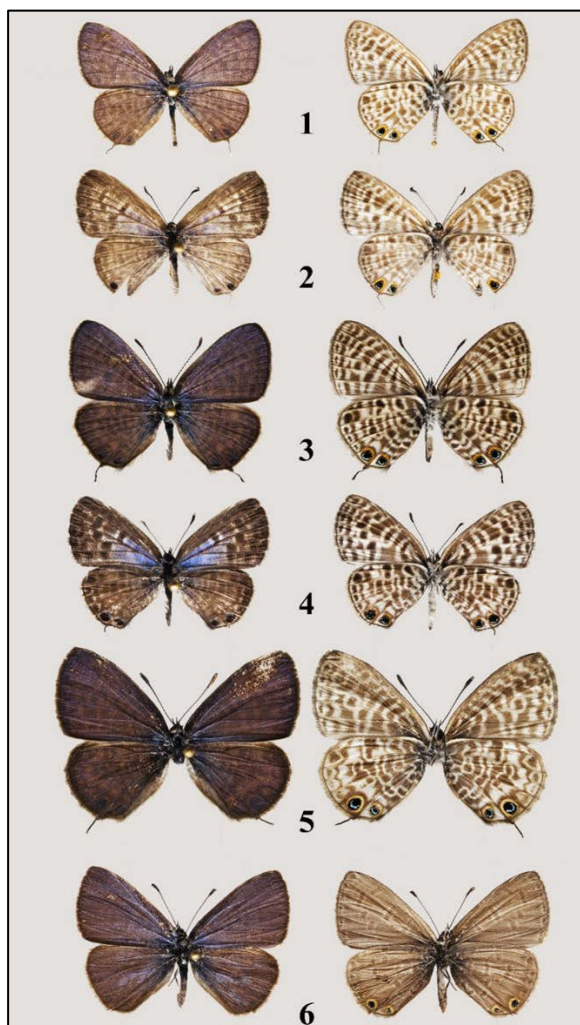
Figure 2 – Adult facies (left: recto, right: verso): 1 – Leptotes pirithous ♂, Palmar; 2 – Leptotes pirithous ♀, Palmar; 3 – Leptotes pirithous ♂, Trou d'Eau Douce; 4 – Leptotes pirithous ♀, Grande Riviere Noire; 5 – Leptotes jeanneli ♂, Palmar; 6 – Cyclyrius mandersi ♂, Palmar.