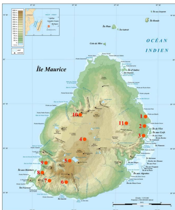
Figure 1 – Map of Mauritius with surveyed localities

took place in or around Curepipe, including gardens and other urbanised areas.