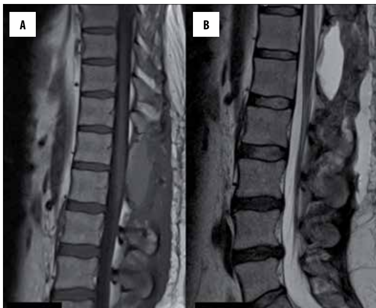
Figure 4. Preoperative T1-weighted MRI sagittal image shows a homogenous contrasted epidural mass at the T12 and L1 levels (A), and the axial T1-weighted MRI shows a mass in the epidural space (B).

The first one involves the large size of the thoracic epidural space, while the second one involves the poor resistance of the posterior thoracic spinal canal as the reason for high incidence rates [2,3].