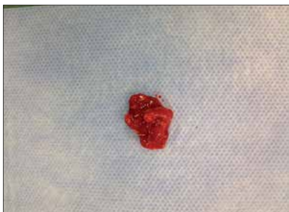
Figure 2. 0.5×1 cm extradural hemorrhagic reddish mass.

No additional neurological deficits were observed during the postoperative period. The first control MRI of the patient was performed after 10 days, and the patient was pain-free. There was no residue on the control MRI (Figure 4A, 4B).