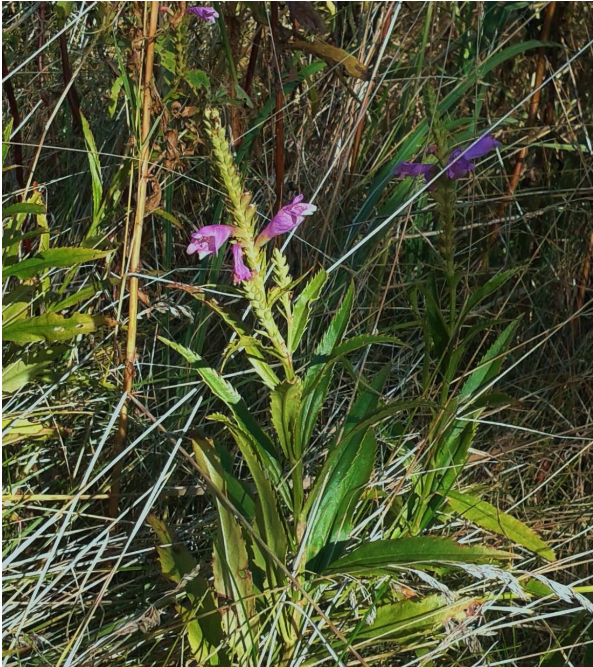
Fig 2: Physostegia virginiana on abandoned allotments in Skarżysko-Kamienna, south-central Poland (Photo by A. Pliszko, 4 October 2015).

shows the clonal growth and relatively small native range. These two factors promote the transitioning of alien plants from casual to naturalised (Milbau & Stout 2008). In Australia, this species is naturalised on roadsides, and appears to spread via rhizomes and possibly by seed dispersal (Hosking et al. 2007). In Japan, it is treated as an invasive plant (Mito & Uesugi 2004). Moreover, it is also worth mentioning that, comparing the new records with the recent floristic data (Maciejczak 1988, Nobis 2007, Podgórska 2011), P. virginiana and its associated species Miscanthus sacchariflorus are new to the flora of the town of Skarżysko-Kamienna.