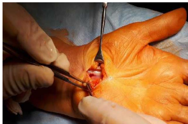
Figure 4. The bloodied median nerve (J. Strychr's material)