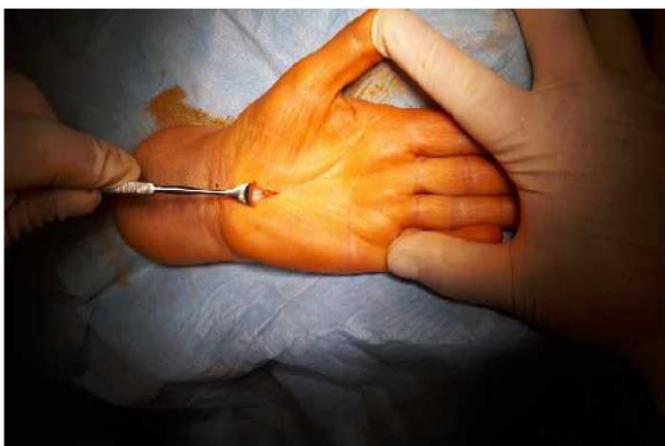
Figure 1. Traditional method (J. Strychr's material)

Most often, the procedure is performed using the open method, which involves cutting the transverse ligament of the wrist under strict visual inspection of the operating surgeon (Figure 1,2,3,4,5).