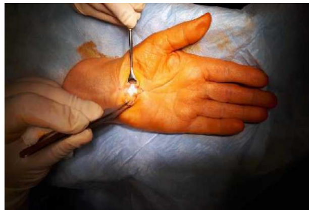
Figure 2. Transverse ligament of the wrist (J. Strychr's material)