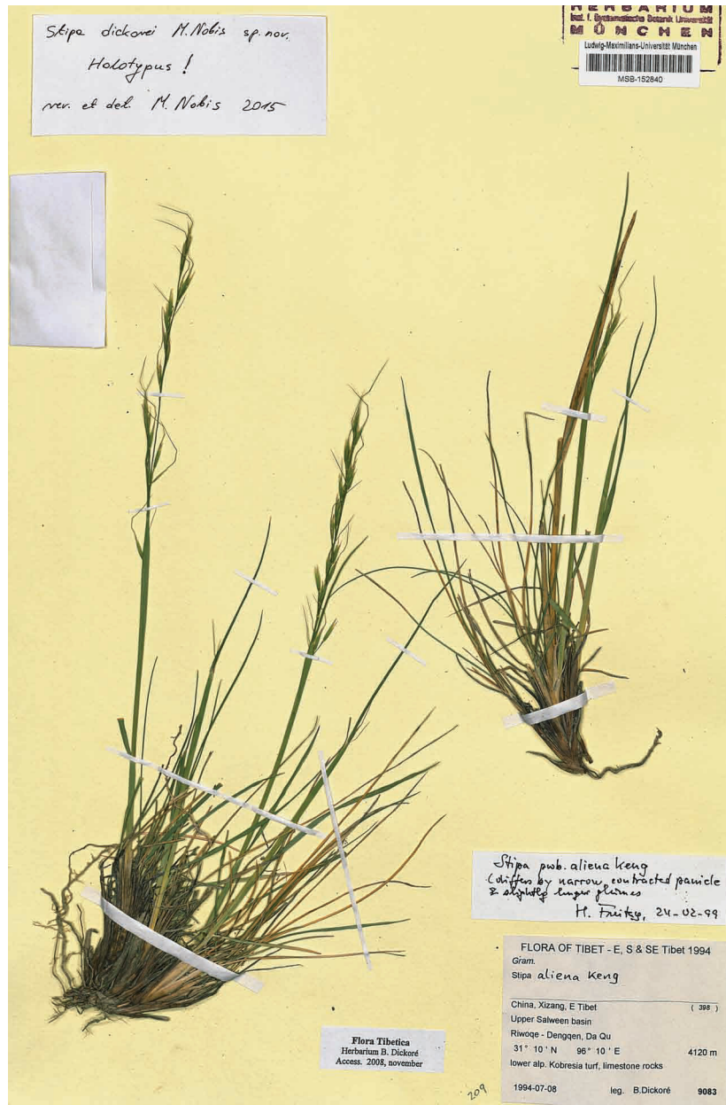
FIGURE 1. Holotype of Stipa dickorei .

10.0–12.5 mm long, lanceolate, tapering into a delicate hyaline apex, glabrous on dorsal line. Anthercium 8.0–9.2 mm long, 0.7–0.9 mm wide. Callus 1.0–1.3 mm long, sharply pointed, densely long-pilose, hairs 0.5–0.9 mm long; base of callus dorsally flattened and long protruding, peripheral ring 0.25–0.30 mm in diameter, scar broadly elliptic. Lemma pale green, on dorsal surface covered by numerous hooks and scattered ascending hairs 0.4–0.7 mm long, top of lemma with coronula of hairs 0.4–1.0 mm long. Awn 20–26(–32) mm long, bigeniculate; column 5–7 mm long, twisted, 0.2(–0.3) mm wide, green or straw-coloured, pilose, hairs (0.2–)0.5–1.0(–1.3) mm long, gradually decreasing in length towards the geniculation; the middle segment of the awn 3–5 mm long, pilose, hairs (0.1–)0.2–0.3 mm long; seta straight, green or purple, 11–15 mm long, hairs on seta 0.1–0.2 mm long. Palea equal to lemma in length, with scattered hairs on dorsal surface. Anthers yellow or purple, glabrous, 3–4 mm long.