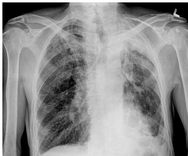
Fig. 4. X-ray of the chest after removal of the drain – normally expanded lungs

Approximately 30 min after the end of the endoscopic examination, the patient reported sudden pain in the right half of the chest, accompanied by dyspnea. Physical examination revealed tachypnea, no alveolar murmur above the right side of the chest, and tympanitic resonance. The obtained chest radiogram visualized right-sided pneumothorax and mediastinal displacement to the left (Fig. 3). During the diagnostic examinations, the patient's condition deteriorated: he lost consciousness, his arterial blood pressure dropped to 50/20 mmHg, and his heart rate slowed to 30 bpm (bradycardia). A drain was immediately inserted into the right pleural cavity, and suction drainage was applied, resulting in swift improvement of the patient's condition. Further radiograms confirmed full expansion of the right lung (Fig. 4). The drain was removed on the 4 th day; on the next day, the patient was discharged home in good general condition.