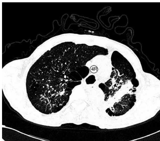
Fig. 5. Chest tomography (pulmonary window) – emphysematous bullae adhering to the mediastinal lymph nodes

Pneumothorax may result from injury of the pulmonary pleura of a previously unchanged lung or from an accidental puncture of an emphysematous bulla during the needle biopsy. In patients with bullous emphysema, this complication may occur as a result of a spontaneous rupture of an emphysematous bulla, caused by an increase of pressure in the chest resulting from strenuous cough during bronchofiberscopy.