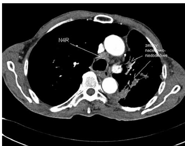
Fig. 1. Chest computed tomography (CT) (mediastinal window) – enlarged mediastinal lymph nodes (N4R) and infiltrative-atelectatic lesions of the left lung and hilum

The 63-year-old male patient with diagnosis of infiltrative lesions of the left lung and hilum as well as mediastinal lymphadenopathy (Fig. 1) and suspicion of hyperplasia