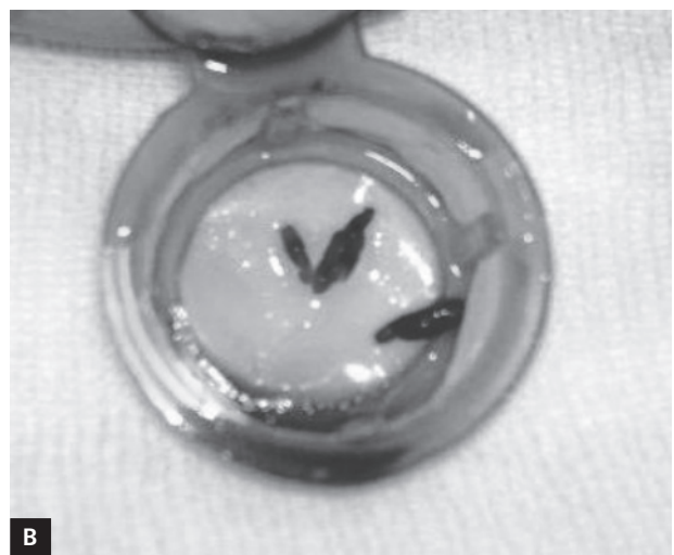
Figure 2. A. Thrombus from first passage; B. Thrombus, final

dings (lack of evidence of atherosclerotic lesions), a diagnosis of embolic origin of the infarction was made, and the procedure was stopped at this point.