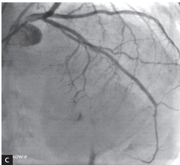
Figure 1. A. Initial angiogram of the left anterior descending artery; B. Control angiogram after first thrombectomy passage; C. Final angiogram