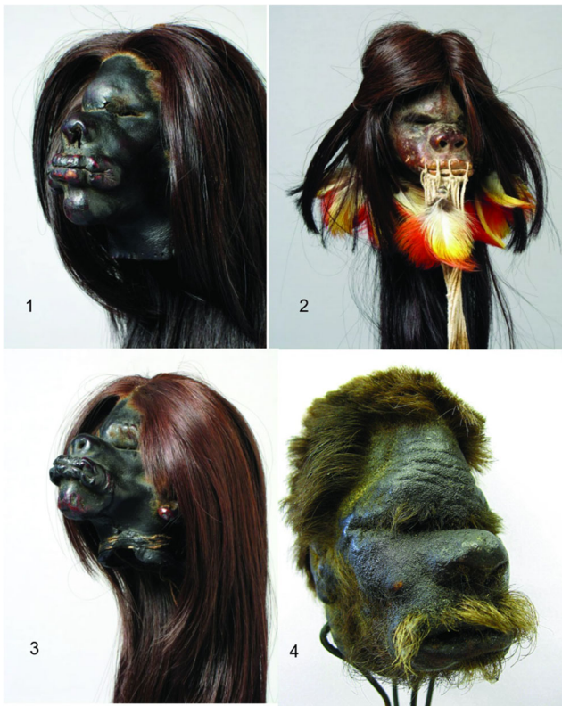
Fig. 1 View of the shrunken heads (The State Ethnographic Museum, Warsaw, Poland: no.1- PME 5261, no.2- PME 12272, no.3- PME 5260; The Museum of the Department of Forensic Medicine at Jagiellonian University Medical College, Krakow, Poland: no.4)

neck in all four shrunken heads. This surface had no direct contact with the outside environment. Each sample was collected into a sterile 1.5-mL Eppendorf tube and incubated overnight at 42 °C prior to DNA extraction. DNA was extracted by enzymatic digestion and ion-exchange column extraction using Sherlock AX kit (A&A Biotechnology, Gdynia, Poland) according to the manufacturer's recommendations. The concentration of DNA was determined by spectrophotometry at 260 nm using a GeneQuant RNA/DNA Calculator (Pharmacia Biotech, Cambridge, UK). PCR amplification was performed in a standard thermocycler (Perkin Elmer GeneAmp 2400, Applied Biosystems, Foster City, USA) and contained 4 ng template DNA in a final reaction volume of 25 \mu L. Five commercially available reagent kits for typing of genomic short tandem repeat (STR) markers were used to study nuclear DNA (nDNA): AmpFISTR Identifiler PCR Amplification Kit, GlobalFiler Amplification Kit, AmpFISTR Yfiler PCR Amplification Kit, and AmpFISTR Yfiler Plus PCR Amplification Kit (all from Applied Biosystems, Foster City, USA). Investigator Argus X-12 Kit was used to type for X-linked STR (Qiagen GmbH, Hilden, Germany). These reagents were validated by the manufacturer and had