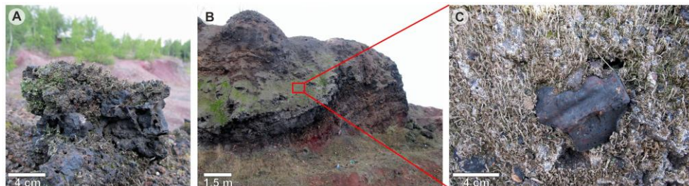
Fig. 1. Post-industrial wastes with associated lichens. A – solid sinter slag overgrown by the most resistant lichens; B – initial stage of succession of post-smelting dump with lichens as the first colonisers; C – dense sward of lichen assemblage covering slag substrate.

Lichens (lichenized fungi) constitute a symbiotic association composed of two units, a lichen-forming fungus (mycobiont) and an alga and/or a cyanobacterium (photobiont), forming a combined organism. Compared with autonomic fungi, lichens have many peculiar features, of which the most important are distinct and highly variable morphology and anatomy, specific metabolic pathways, and exclusive methods of reproduction. Lichens occur at all latitudes and grow on almost any type of substrate. The structure and physiology of lichens decide their success in the colonisation of environments extremely hostile to life [4]. Lichens have been defined as stress tolerators [5] and they are effective and rapid colonisers of bare ground [6] Their pioneer nature is associated not only with natural sites characterised by harsh climate conditions, but also with anthropogenic and strongly affected habitats. There are various adaptation mechanisms facilitating successful colonisation of such areas (see e.g. [7]). Some epigeic lichens with modest ecological requirements are known to be the first and most important colonisers of contaminated substrates [8-11] (Fig. 1).