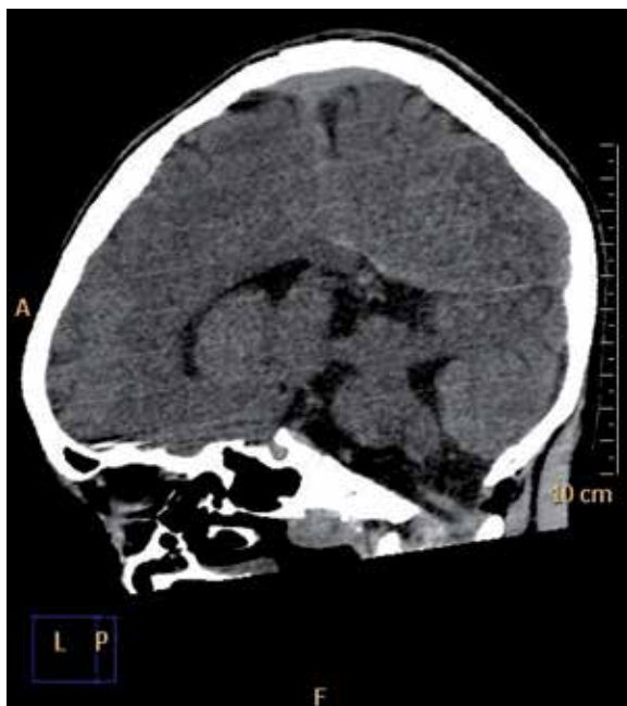
Figure 4. Sagittal reformatted section of computed tomography of the brain showing thickened superior cerebellar peduncles oriented horizontally.

The clinical features include episodic hyperpnoea and apnoea in the neonatal period, ocular abnormalities (oculomotor apraxia and ocular coloboma), hypotonia, truncal ataxia, developmental delay, intellectual impairment and abnormal facies [4,5].