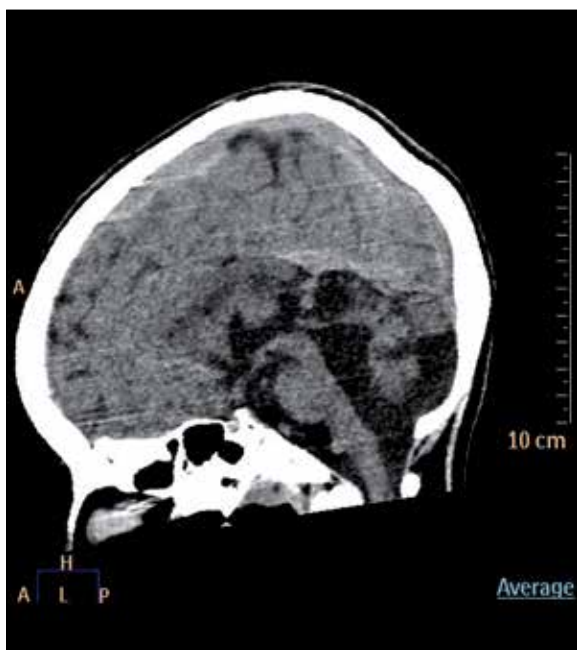
Figure 2. Median sagittal reformatted section of computed tomography of the brain showing hypoplastic vermis with dilated fourth ventricle and deep interpeduncular fossa.