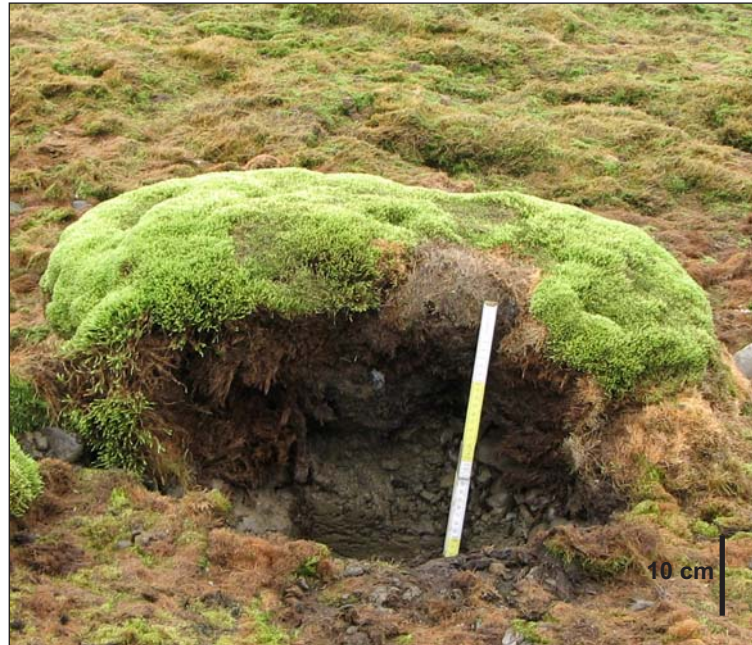
Fig. 6. Thufur containing ice lenses (visible in central part under moss carpet).

surface is often covered by sparse vegetation. In some places, with high influence of birds, Leptic Regosols (Ornithic) (Profile 033) are almost entirely covered by mosses ( Brachythecium turgidum , Sanionia uncinata ), Arctic mouse-ear ( Cerastium arcticum ), grass ( Poa alpina var. vivipara ) and Chrysosplenium tetrandrum being the most common species of vascular plant (Table 1). It is related to enrichment of surface horizon of the soils in nitrogen and phosphorus (Tables 2 and 3). Such soils (covering 6.5% of the catchment) show sandy loam texture, lack or very low amount of carbonates and slightly acidic or neutral reaction (Table 2). High content of soil organic carbon (up to 11.2%) in such soils is effect of dense vegetation cover which provides organic substrate. On the rock outcrops occurring close to Leptic and Haplic Regosols, very thin Lithic Leptosols are also present.