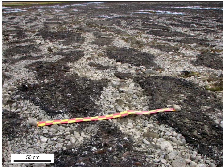
Fig. 3. Patterned ground showing clear segregation by frost.

soil material due to cryoturbation. Chemical composition of Turbic Cryosols is similar to the composition of Haplic Cryosols (Table 3). However, Turbic Cryosols contain lower amount of \text{SiO}_2 (63.7–65.9%) and higher amounts of \text{Al}_2\text{O}_3 (17.0–18.3%) and \text{Fe}_2\text{O}_3 (8.4–8.9%) than Haplic Cryosols, which is likely related to higher amounts of aluminosilicates ( i.e. clay minerals) and lower amount of quartz in Turbic Cryosols than in Haplic Cryosols.