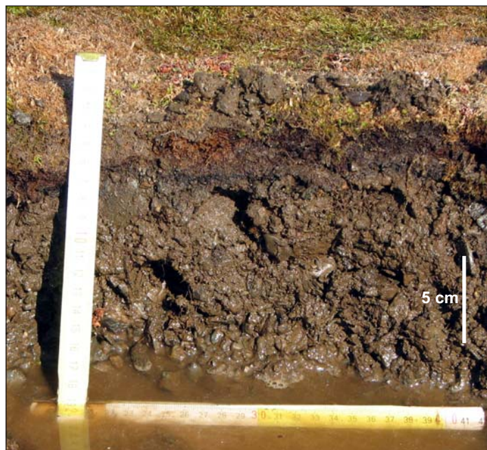
Fig. 5. Hyperskeletal Cryosol (Reductaquic) with thin histic-like horizon.

1.2%) (Table 2). Such soils cover 2.5% of the studied area and are habitats for lichens, Saxifraga oppositifolia , and Cerastium arcticum (Table 1). Rock outcrops forming from marbles are parent material for thin Lithic Rendzic Leptosols. The soils exhibit sandy texture, alkaline reaction and quite high content of carbonates. Content of soil organic carbon is similar to that of Lithic Leptosols ( i.e. 1.0–1.5%). Lithic Rendzic Leptosols are covered by lichens, Saxifraga oppositifolia , S. caespitosa and Polygonum viviparum .