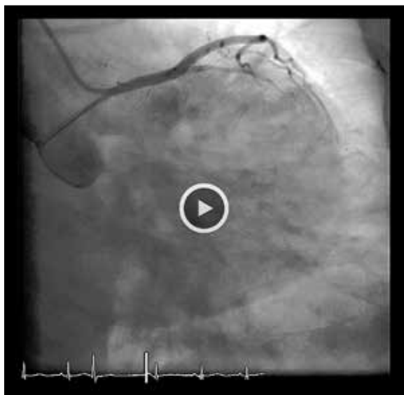
Video 1. Left coronary angiogram showing flow through the left main coronary artery and LAD, with absence of the LCX (corresponds to Figure 1).