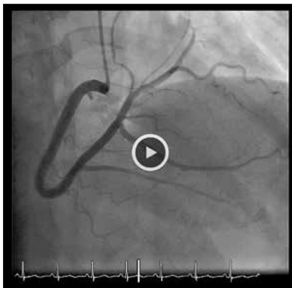
Video 2. Left coronary angiogram showing flow through the super dominant RCA and PLV (corresponds to Figure 2).

stress and anxiety, after she was informed of the death of her husband. The patient's physical exam, electrocardiography, and laboratory findings were benign, except for persistently elevated troponins on serial measurements (peak troponin I value of 0.28). Left heart catheterization revealed a congenital absence of the left circumflex coronary artery (LCX) as illustrated in Figure 1 and Video 1, with a super-dominant right coronary artery (RCA) with an extensive posterolateral ventricular branch (PLV) supplying the territory normally supplied by the LCX, illustrated in Figure 2 and Video 2. The patient was diagnosed with a congenital absence of the LCX without evidence of atherosclerotic cardiovascular disease. Following left heart catheterization, the patient was free of chest pain and was discharged the following day with recommendations for