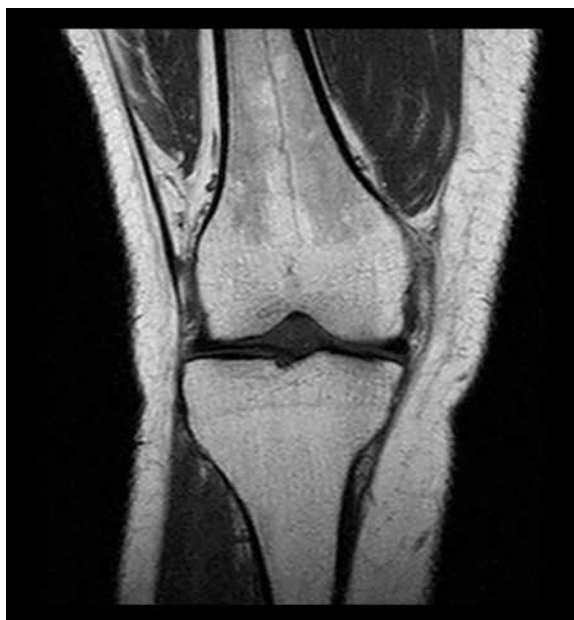
Figure 2. The T1WS coronal sequence of knee MRI of a 36-year-old female weighing 66 kg. The residual red bone marrow areas were of grade 3 (Hgb level: 15.1 g/dL).

marrow with the help of MR images, and discuss the usefulness of reporting these areas in daily routine.