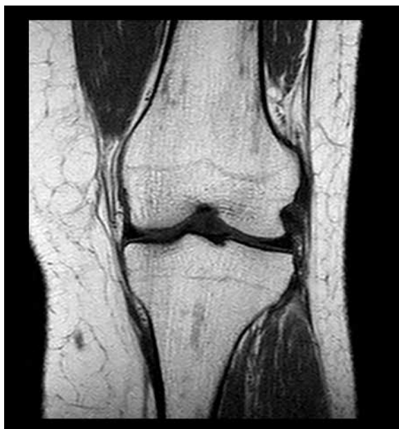
Figure 1. The T1WS coronal sequence of knee MRI in a 36-year-old female weighing 80 kg. The residual red bone marrow areas were of grade 1 (Hgb level: 12.9 g/dL).