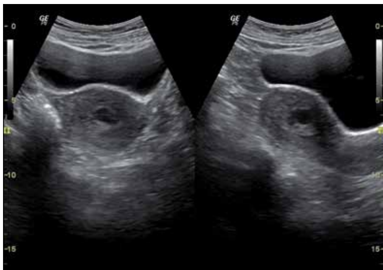
Figure 1. Transverse and longitudinal gray scale ultrasound images of the uterus showing multiple tortuous serpiginous anechoic areas in the myometrium which were most pronounced in the fundic region.