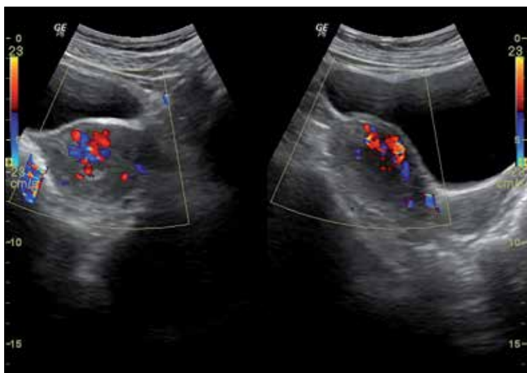
Figure 2. Transverse and longitudinal colour Doppler evaluation of these lesions depicted mixed arteriovenous waveforms with colour aliasing.