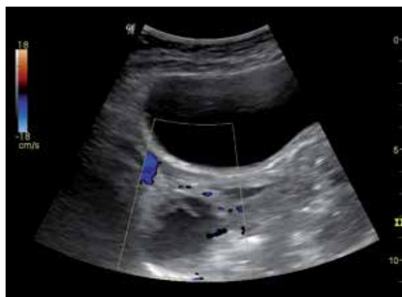
Figure 5. Colour Doppler shows no internal vascularity in the right adnexal cyst with minimal peripheral vascularity.

She underwent abdominal hysterectomy. Microscopic examination of the uterus showed that the endometrium was in the proliferative phase and the myometrium showed multiple ectatic vessels of varying calibre some of which were extending up to the serosa.