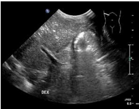
Figure 2. Follow-up abdominal US examination in a 5-month-old girl after NEC and a partial small bowel resection performed in the third month of age. The US image shows small gas bubbles in the liver parenchyma and in the branches of the portal vein.

another hospital. We observed a complete resolution of HPVG in all 10 patients – in four cases, it was seen on the next day, in 5 cases within 2–4 days. Only one child had persistent HPVG on ultrasound examinations within the next 28 days, and a complete resolution was seen on day 47. This patient was 1-month old and had lower gastrointestinal haemorrhage and a co-existing allergy to milk protein and anaemia. In one case HPVG partially normalized and was not followed up by further imaging. None of the patients required abdominal CT.