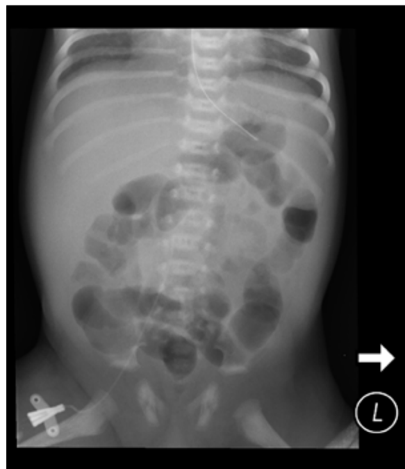
Figure 4. The same patient as in Figure 3. Abdominal radiograph shows no signs of HPVG.