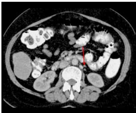
Figure 5. Contrast-enhanced CT scan of the upper abdomen shows multiple subcentimeter paraaortic lymph nodes (red arrow).

surrounding infiltration. The rectum (opacified with rectal contrast) was seen to be markedly compressed and deviated to the right lateral location (Figure 2A, 2B). The tumor was abutting the sacral surface and the sacrum revealed scalloping due to a long-standing compression (Figure 3). Multiple liver metastases (Figure 4), paraaortic and iliac lymph node metastases (Figures 5, 6) were seen. The imaging findings of a presacral solid mass with nodular calcifications, the conspicuous absence of cystic or adipose contents and of sacral erosion and the presence of hepatic and lymph node deposits at initial presentation, all suggested a retroperitoneal sarcoma in the pelvic location. The laboratory tests showed mildly elevated hepatic parameters and prolonged prothrombin time. After 48 hours of Vitamin K therapy, a CT-guided biopsy was performed through the gluteal approach, which revealed a presacral fibrosarcoma. The final diagnosis was that of a retroperitoneal fibrosarcoma in presacral region, with lymph node and liver metastases. The patient and her family refused any treatment, including chemotherapy and