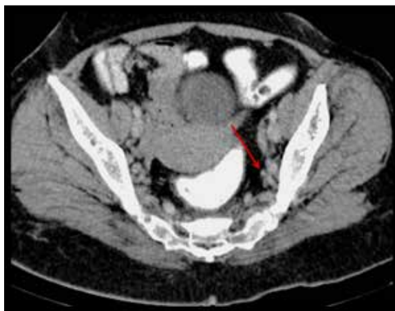
Figure 6. Contrast-enhanced CT scan of the lower abdomen shows multiple subcentimeter internal iliac lymph nodes (red arrow).

surrounding infiltration. The rectum (opacified with rectal contrast) was seen to be markedly compressed and deviated to the right lateral location (Figure 2A, 2B). The tumor was abutting the sacral surface and the sacrum revealed scalloping due to a long-standing compression (Figure 3). Multiple liver metastases (Figure 4), paraaortic and iliac lymph node metastases (Figures 5, 6) were seen. The imaging findings of a presacral solid mass with nodular calcifications, the conspicuous absence of cystic or adipose contents and of sacral erosion and the presence of hepatic and lymph node deposits at initial presentation, all suggested a retroperitoneal sarcoma in the pelvic location. The laboratory tests showed mildly elevated hepatic parameters and prolonged prothrombin time. After 48 hours of Vitamin K therapy, a CT-guided biopsy was performed through the gluteal approach, which revealed a presacral fibrosarcoma. The final diagnosis was that of a retroperitoneal fibrosarcoma in presacral region, with lymph node and liver metastases. The patient and her family refused any treatment, including chemotherapy and