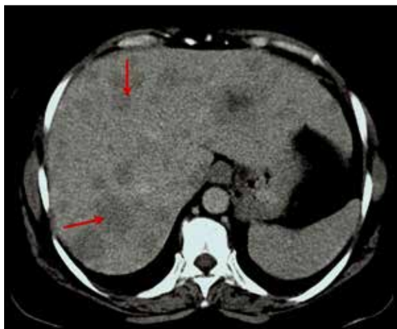
Figure 4. Contrast-enhanced CT scan of the upper abdomen shows multiple non-enhancing metastases (red arrows).