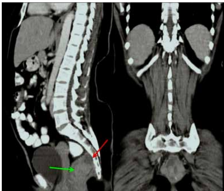
Figure 3. Contrast-enhanced CT scan of the pelvis in sagittal and coronal reformats reveals a solid, moderately enhancing presacral tumour (green arrow) causing mild scalloping of the sacrum (red arrow).