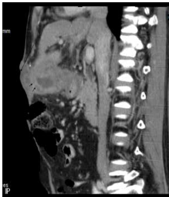
Figure 4. Sagittal reformatted contrast-enhanced CT showing GB fundus adherent to the anterior abdominal wall with ulceration of the overlying skin (long arrow). There is concentric thickening of the GB wall showing inhomogeneous enhancement (small arrows).

measuring approximately 36×25 mm (Figure 5). A fistulous tract was seen as a fluid-density streak extending from the peri-cholecystic area to the anterior abdominal wall and skin (Figure 5). The common bile duct (CBD) measured 7 mm in diameter. The intra-hepatic biliary radicles (IHBRS)