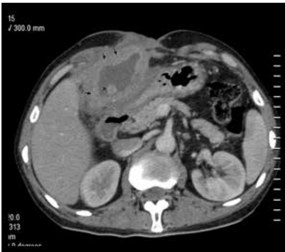
Figure 2. Contrast-enhanced axial CT showing the fundus of GB reaching up to the anterior abdominal wall. There is marked thickening of the GB wall (arrows). A calculus is also seen in the lumen of GB (arrow head).

machine. Oral as well as intravenous non-ionic low-osmolar iodinated contrast medium was given via the antecubital vein. Non-contrast followed by contrast-enhanced scans were acquired in the portal phase. On CT, the gall bladder (GB) was found to be well distended and the fundus of GB was reaching up to the anterior abdominal wall in the midline (Figure 2). The fundus of GB seemed to be adherent to the anterior abdominal wall and there was stranding in the subcutaneous and peri-cholecystic fat suggestive of inflammatory changes. There was concentric thickening of the wall of GB measuring up to 13 mm, showing heterogeneous enhancement (Figures 2–4). Multiple rounded hyperdense calculi were seen in the lumen of GB (Figures 2, 5). A defect of approximately 9 mm in size was seen in the wall of GB (Figures 3, 5) and a small fluid collection was observed in the peri-cholecystic area near the defect,