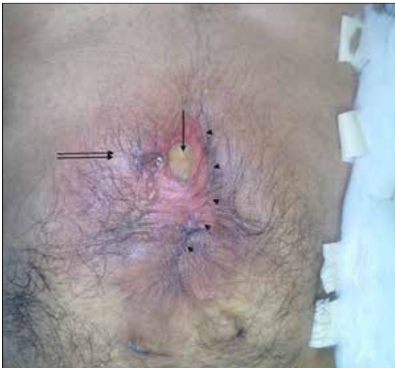
Figure 1. Photograph of the abdomen of the patient, showing external opening of the fistula (arrow) overlying an old laparotomy scar (arrow heads) and erythema of the surrounding skin (double arrow).