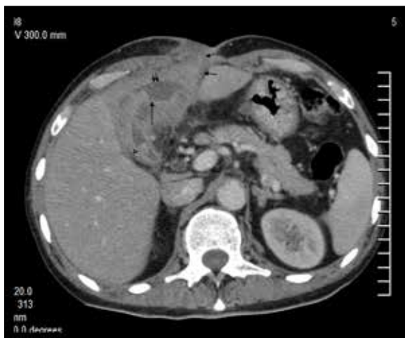
Figure 5. Contrast-enhanced axial CT showing a heterogeneously-enhancing thickened GB wall with small peri-cholecystic fluid collection (double arrow) adjacent to a small defect in the GB wall (long vertical arrow). Linear fistula tract is seen extending from the GB fossa to skin (small arrows). Hyperdense calculus is also noted in the lumen of GB (arrow head).

were not dilated. However, air-density foci were seen in IHBR, suggestive of pneumobilia (Figure 3).