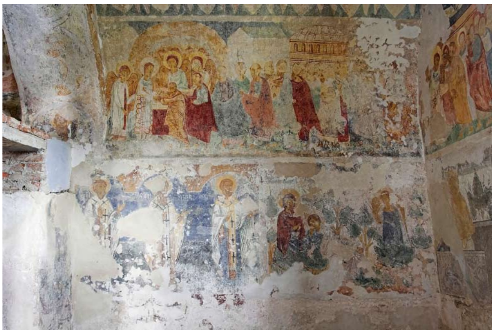
Fig. 4. Posada Rybotycka, fresco of the presbytery, view on the northern wall

less static and stylised became more prevalent, showing hierarchs, slightly bowed and in three-quarter profile, moving to the east in two equal processions. In most cases an altar is shown in the middle of the apse wall, on which, from the end of the twelfth century a representation of the Holy Child was placed on the paten (Kurbínovo, 1192), and from the fourteenth century a representation of the deceased Christ 5 . The selection of bishops who were represented was not prescribed, but was dependent upon local custom. However, in most cases the procession was opened by two great patriarchs who were also creators of the liturgy, John Chrysostom on one side, and Basil the Great on the other 6 . Generally directly behind them, or on occasion further back in the procession were Gregory of Nazianzos, Athanasios, Cyril of Alexandria and Nicholas of Myra.