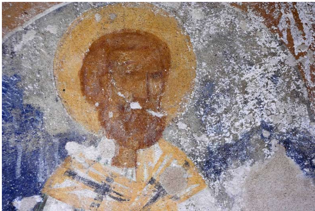
Fig. 9. Nicolas of Mira , detail from The Officiating Bishops

Sophia in Kiev 32 . He was frequently depicted in the procession, but his place within it varied. In orthodox churches in Crete, for example, he was usually placed directly behind one of the liturgists 33 . He is to be found in this position in both the Theotokos orthodox church in Lagoudera, Cyprus 34 and Hagioi Anargyroi in Kastoria 35 . However, he was sometimes depicted further back in the procession.