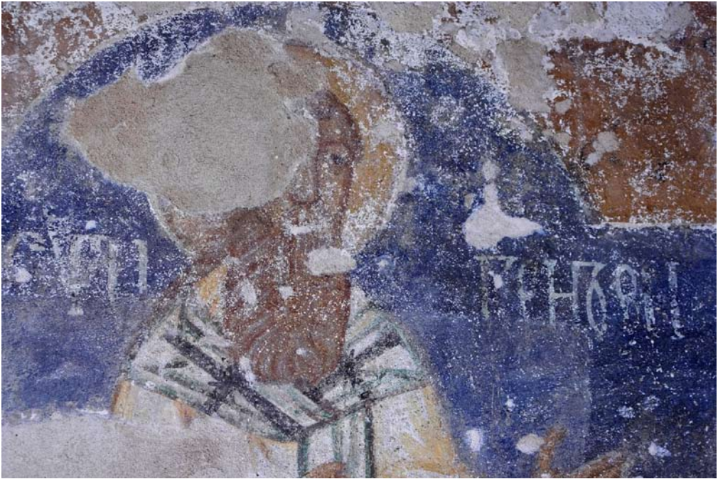
Fig.8. Gregory the Theologian with inscription, detail from The Officiating Bishops

28 in Ostrov near Pskov 29 ; and a beard which is only slightly shorter in the noted representation of St. Paraskeva with the three hierarchs in the Tretyakovskaya Gallery 30 .