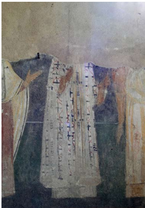
Fig. 5. John Chrysostom, detail from The Officiating Bishops