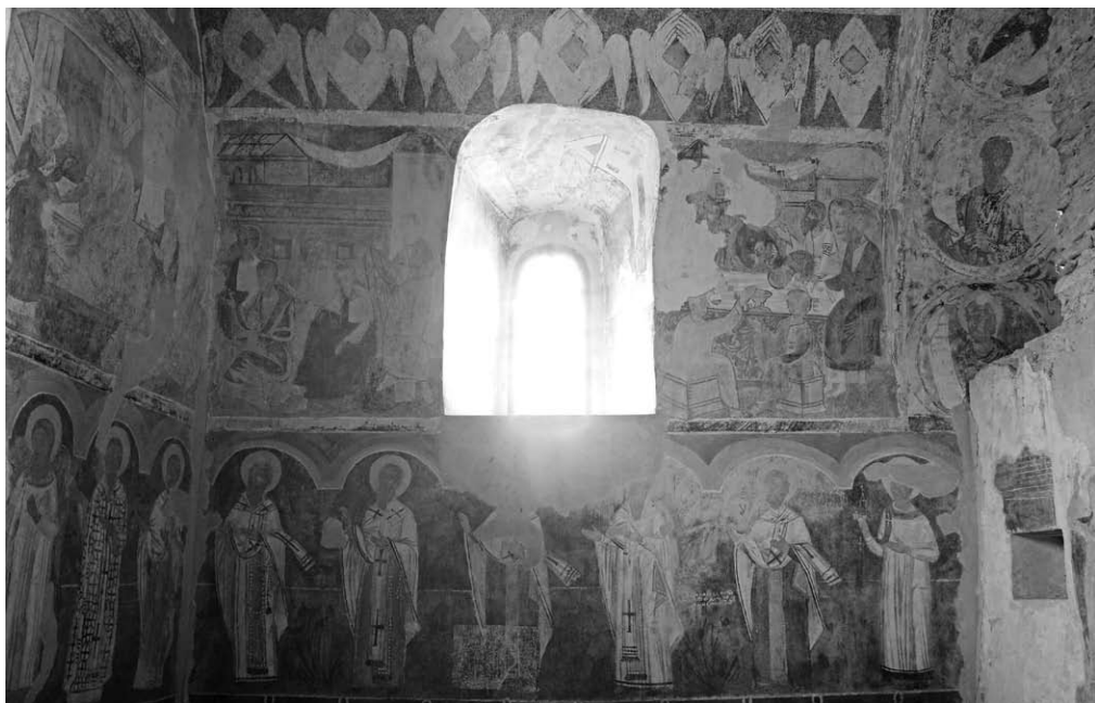
Fig. 3. Posada Rybotycka, fresco of the presbytery, view on the southern wall