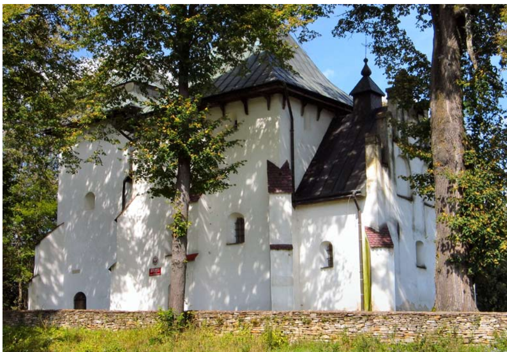
Fig. 1. Posada Rybotycka, St. Onuophrios' church in, the main view

close in date to those used in Moldova in the sixteenth and seventeenth centuries 3 . In addition, these findings are corroborated by an initial iconographic analysis that indicates two independent painting schemes. The earlier of these probably dates from the sixteenth century, and is to be found in the presbytery, while the later one is to be found in the nave.