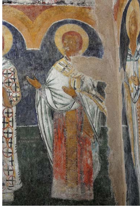
Fig. 7. Gregory the Great?, detail from The Officiating Bishops

It seems, however, that in Posada Rybotycka Gregory the Theologian is not standing behind either John Chrysostom or Basil of Caesarea. The bishop on the right has luxuriant dark hair and a small beard, a representation which is far from Gregory's established iconography. The top parts of the bishop on the left are damaged, but in the area currently obscured with plaster immediately under the face there isn't enough space for a beard as wide as those in the representation of the bishop in the Saviour's monastery church in Chora (Kahriye Camii) 22 and in Myriokephala in Crete 23 , or as long as the beard on the wall of the orthodox church of the Holy Mother Peribletta in Mistra 24 , on the Three Hierarchs icon dating from the first half of the fourteenth century in Tretyakovskaya Gallery 25 or in The Stroganov