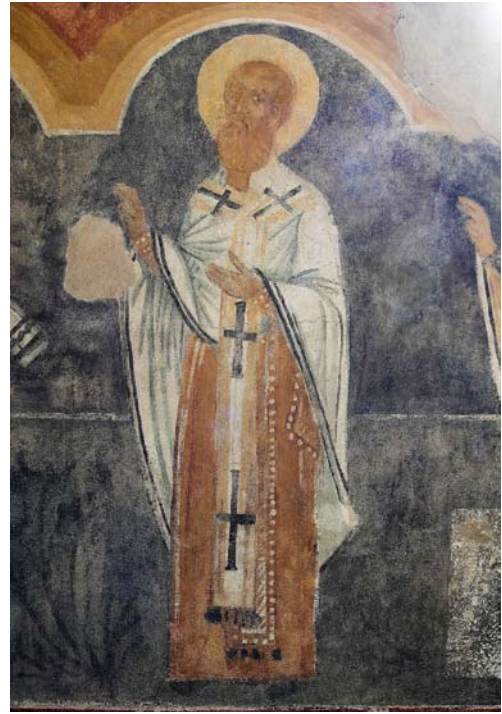
Fig. 12. Athanasios of Alexandria ?, detail from The Officiating Bishops

Nicholas Orphanos in Thessaloniki 47 , in Moldovita 48 and in Kastoria (Panagia Mavriotissa, Taxiarches) 49 . He is usually represented as a balding old man with a broad beard 50 , sometimes slightly shorter, as in the above mentioned orthodox church in Kiev 51 , or longer, as in Hagios Athanasios in Kastoria 52 , often consisting of thick curls. Dionysius of Fourni also mentions a bald head and a broad beard as part of this saint's description 53 , and in The Stroganov Patternbook there is sparse hair over a high forehead, and the lower parts of the face are lost in a luxuriant beard which is rounded at the bottom 54 . In the orthodox church in Posada only the second bishop on the southern wall of the sanctuary fits this description (fig. 12). What is noteworthy is primarily the shape of his mid-length beard, which is thick and rounded, where thick, fair curls are clearly visible against the dark background provided by the backdrop.