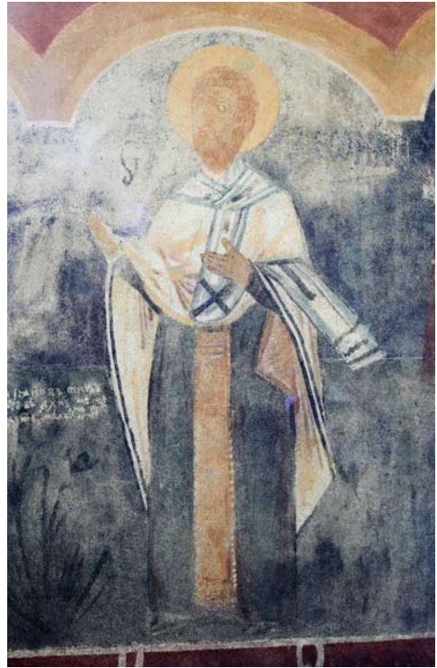
Fig. 10. Dionysius the Areopagite , detail from The Officiating Bishops

sistent iconographic formula for this Saint. In the Synaxarion of Constantinople his description runs as follows: a man of “moderate height, emaciated, with white and sallow skin, flat-nosed, with puckered eyebrows, sunken eyes, always deep in thought, with large ears, abundant grey hair, a slightly cleft upper lip, a straggly beard, a slight paunch and long slender fingers” 37 Further, a black and white drawing in The Stroganov Patternbook provides a short description which informs us that the thick hair and the beard, unkempt at the bottom, are white 38 . Dionysius of Fournas puts forward a representation of him as ‘an old man, with long curly hair and a parted beard’ 39 , and The Bolshakov Patternbook describes the way in which his white, curly hair was arranged: ‘like that of St. Clement whose hair is described as ‘arranged at the bottom below the ears, like St. George’s’ 40 . In Posada Rybotycka he is depicted as a young man with dark hair and a short beard, similar to that in Old Metropolis of Veroia 41 or in a miniature in Chludov’s Psalter 42 .