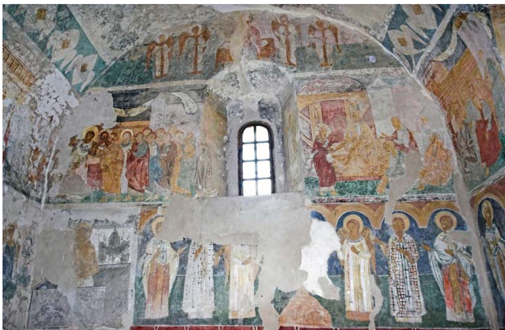
Fig. 2. Posada Rybotycka, fresco of the presbytery, view on the western wall