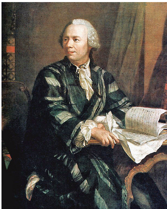
Fig. 1. Leonhard Euler (1707–1783) c. 1756.

Leonhard Euler hardly needs to be presented to anyone as everybody is well-acquainted with his – if not all then at least with the most important – scientific achievements.